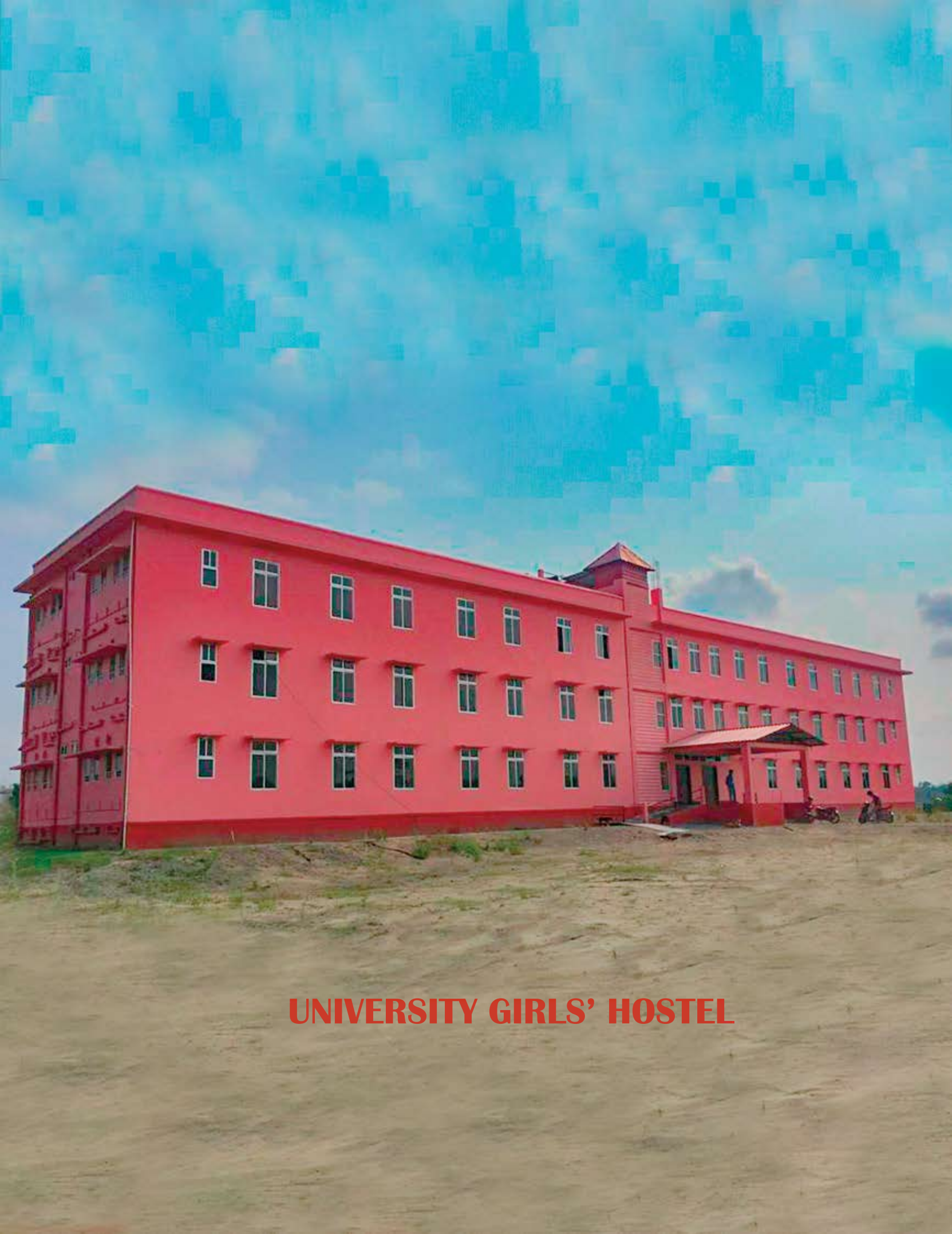
UNIVERSITY GIRLS' HOSTEL