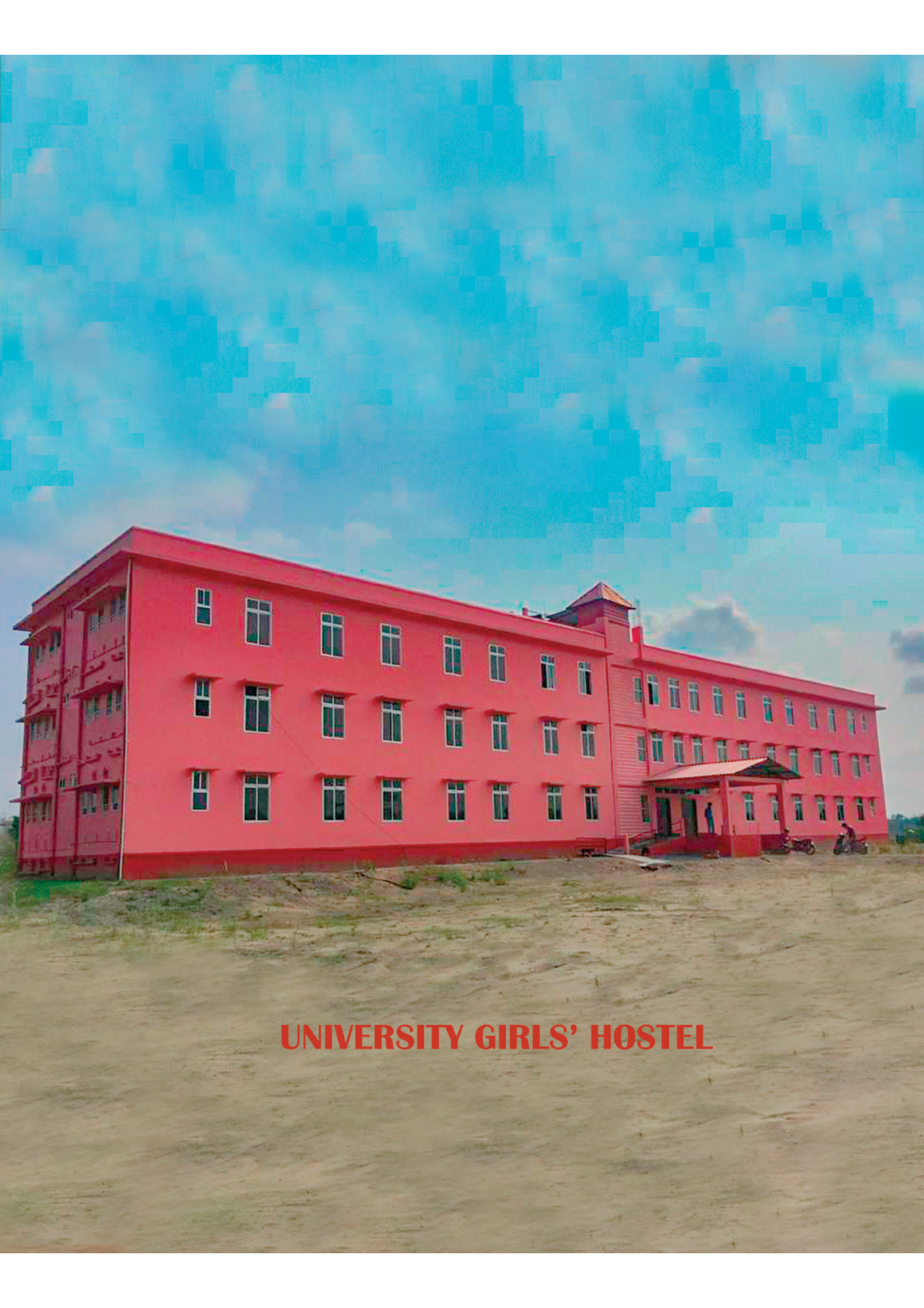
UNIVERSITY GIRLS' HOSTEL